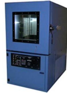
G (B/D) - 16